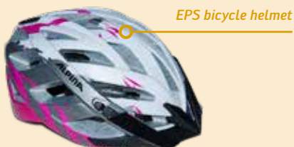
EPS bicycle helmet

PARTICLE FOAM APPLICATIONS – FOAMED ON KURTZ SHAPE MOULDING MACHINES – CONTAINED IN MANY EVERYDAY PRODUCTS