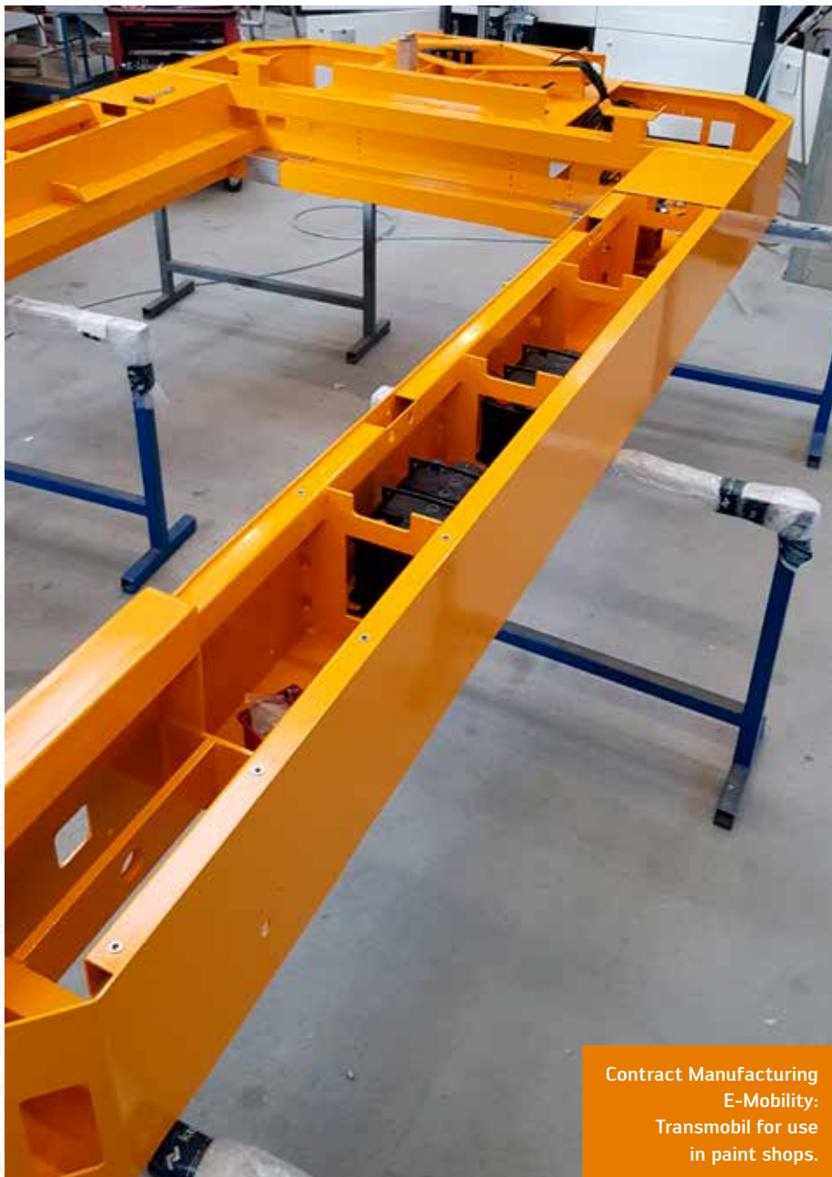
Contract Manufacturing E-Mobility: Transmobil for use in paint shops.

After an agreed design freeze, the machine goes into series production and can be delivered as of February – the complete electrical and mechanical assembly as well as the purchase are in the hands of Conline. At the same time, the development of peripheral units for automated processing in large quantities is started, which then dock directly onto the Hot Seal Unit – associated functions include, for example, automatic product insertion, integration of an enclosure, printing of a barcode. Conline operates comprehensive warehousing for these projects, thus ensuring a seamless supply to the customer and thus becoming an integrated partner in the customer's production. ■