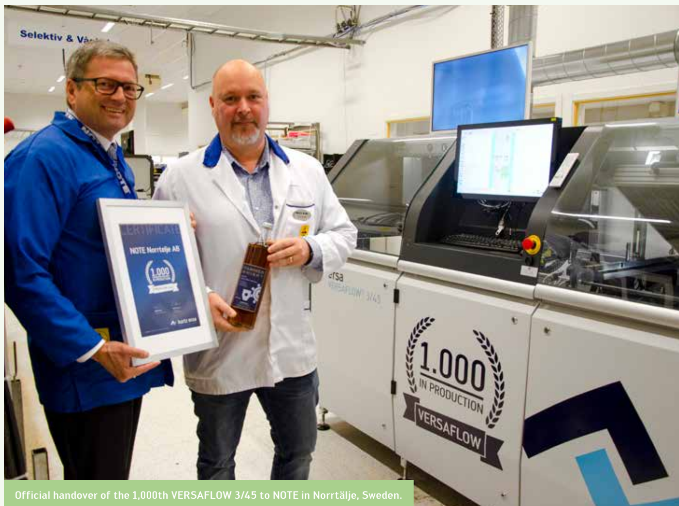
Official handover of the 1,000th VERSAFLOW 3/45 to NOTE in Norrtälje, Sweden.

“We not only recognised the trend in time but also managed to develop suitable machines – which is what distinguishes us as the market leaders from competitors on the market,” explains Ersä Sales Manager Rainer Krauss. Other machines from Ersä that round off the selective portfolio at the smaller end are also worth a mention here: SMARTFLOW 2020, ECOCELL, ECOSELECT 1, ECOSELECT 4 – despite their extremely compact design, the smaller machines from the selective family can rely on innovative no-compromise Ersä technologies – just like the larger members of the family! ■