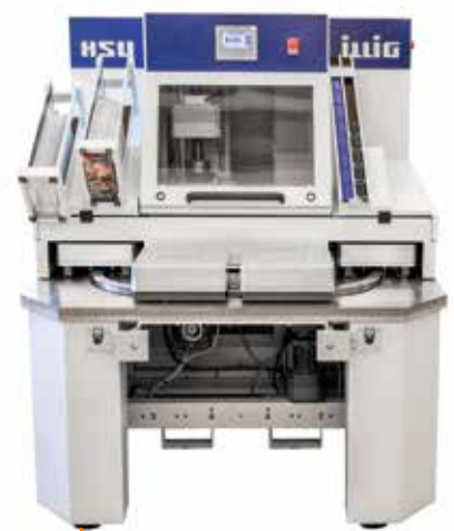
Contract Manufacturing Packaging Industry: Hot Seal Unit for blister packaging.

But a complete expansion stage with fully automatic transport via central 4.0 control systems is also planned – with detailed analysis at the end of the year, the foundation stone was laid for the new development, which already contains the options with regard to control, electronics and design. Series production is expected to start in spring/mid-2019.