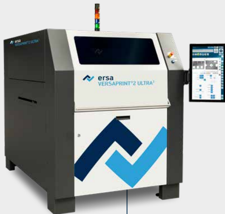
○ Ersa VERSAPRINT 2 ULTRA 3

tional inspection of the printing result. The VERSAPRINT 2 Elite plus has a stencil support for adjustment without tools, is suitable for frame sizes from 450 to 740 mm and can be retrofitted with all available VERSAPRINT 2 options including 2D and 3D camera.