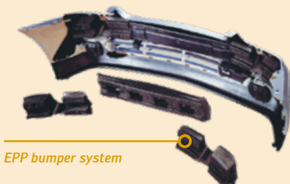
EPP bumper system