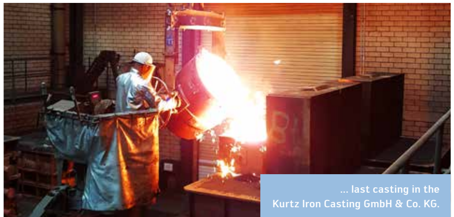
... last casting in the Kurtz Iron Casting GmbH &amp; Co. KG.

As of 01 October, 2018, Rheinische Mittelstandsbeteiligung (RMB) took over the traditional foundry Kurtz Eisenguss GmbH & Co. KG in Hasloch. Up to then it had belonged to the Kurtz Ersä Group, but its strategic significance was on the decline – latterly its share of total sales was running at 6 %.