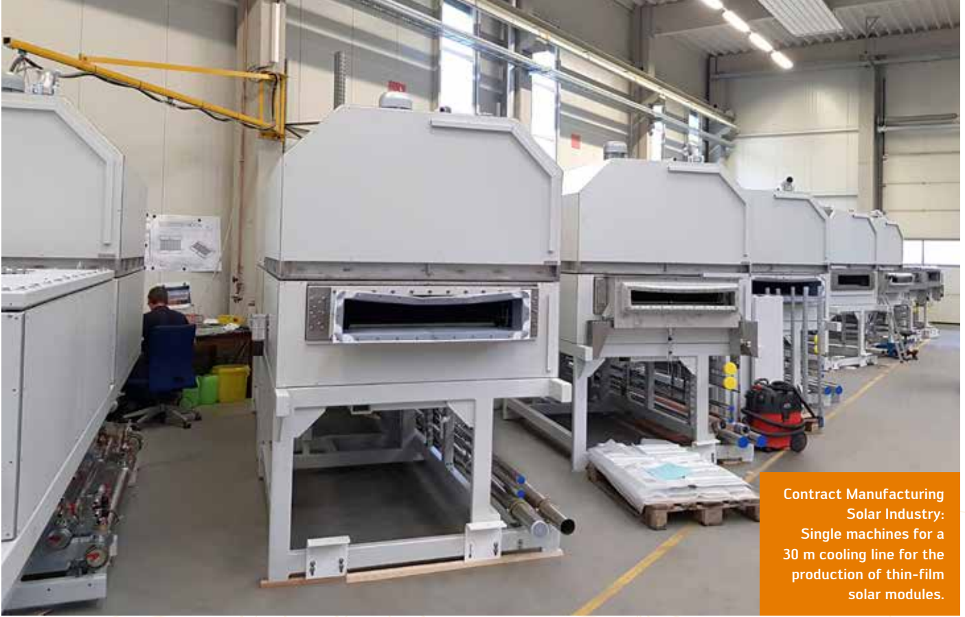
Contract Manufacturing Solar Industry: Single machines for a 30 m cooling line for the production of thin-film solar modules.