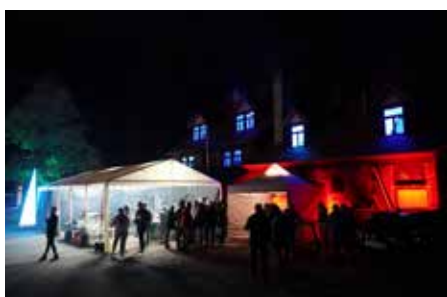
ROCK CONCERT IN HAMMER FORGE